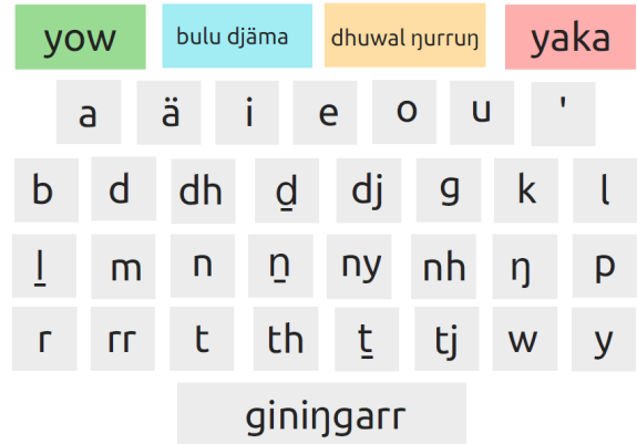
Alphabet Board – Yolḡu Matha

Who can I talk to if I have questions or concerns?